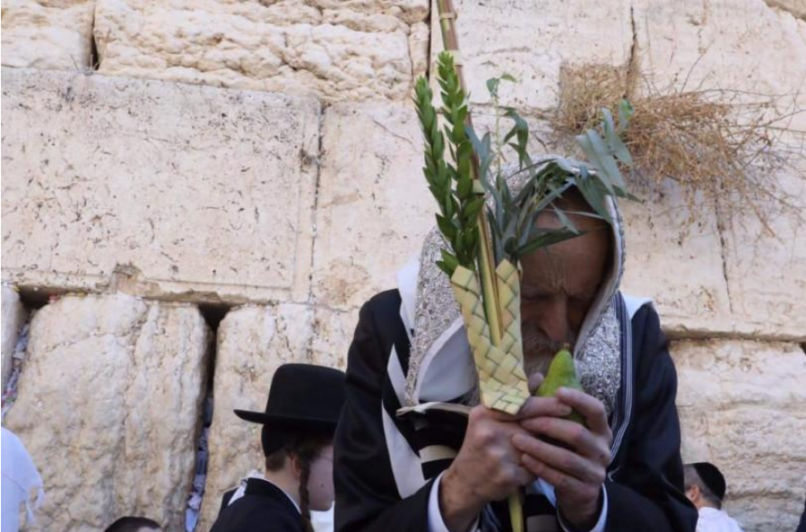
A MAN blesses the Arba Minim or Four Species, carrying a lulav, etrog, aravot and hadassim during the Birkat Kohanim Priestly Blessing at the Western Wall at Hol Hamoed Sukkot, September 2021.

The Western Wall saw a million worshipers during the High Holy Day season this year, after COVID-19 restrictions were eased.